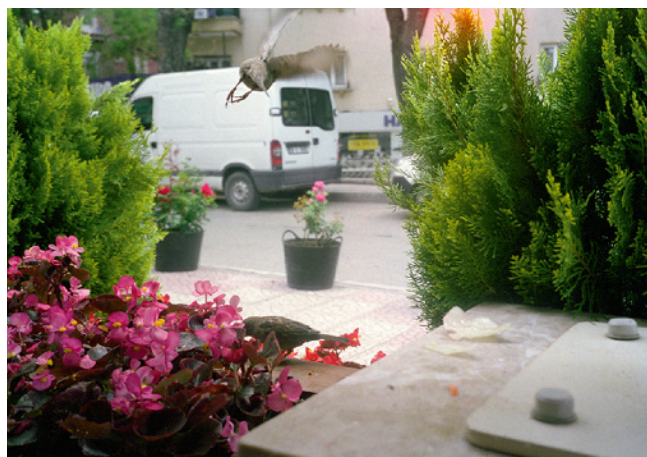
2 Breakfast guests, Ankara, Turkey, 2012, 16 x 20 in. ©André Príncipe, Courtesy of Akio Nagasawa Gallery