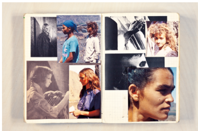
1 Casa de lava - Caderno page #4