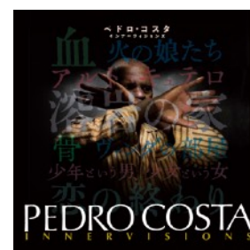
Main visual for “Pedro Costa Innervations” from Horse Money , 2014